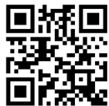
FPC.LC/News Newsletter Sign-Up