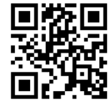
FPC.LC/Sermons Livestream and/or Replay Worship Services

More information can be found on our website fpc.lc